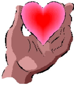
My Heart Christ's Home